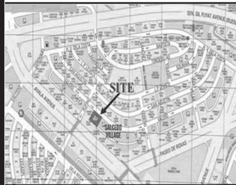
Note: For Possession