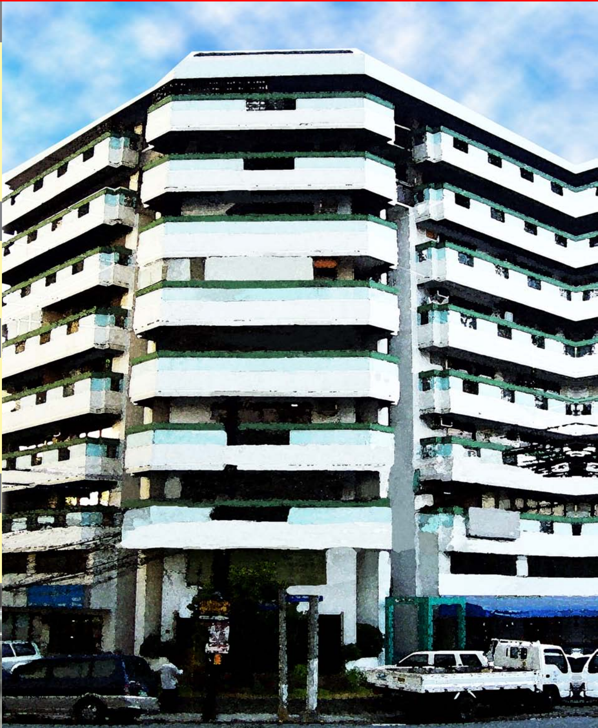
Benjamin Building #62 Sgt. Esguerra St. (Bohol Avenue) Cor. Mo. Ignacia St., Diliman, Quezon City

Prices are subject to change without prior notice. Misprints may occur.